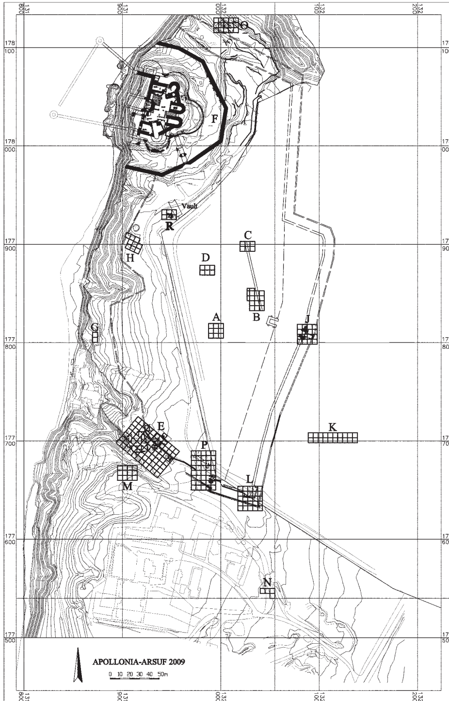
Fig. 1. Apollonia-Arsuf (2009): site plan